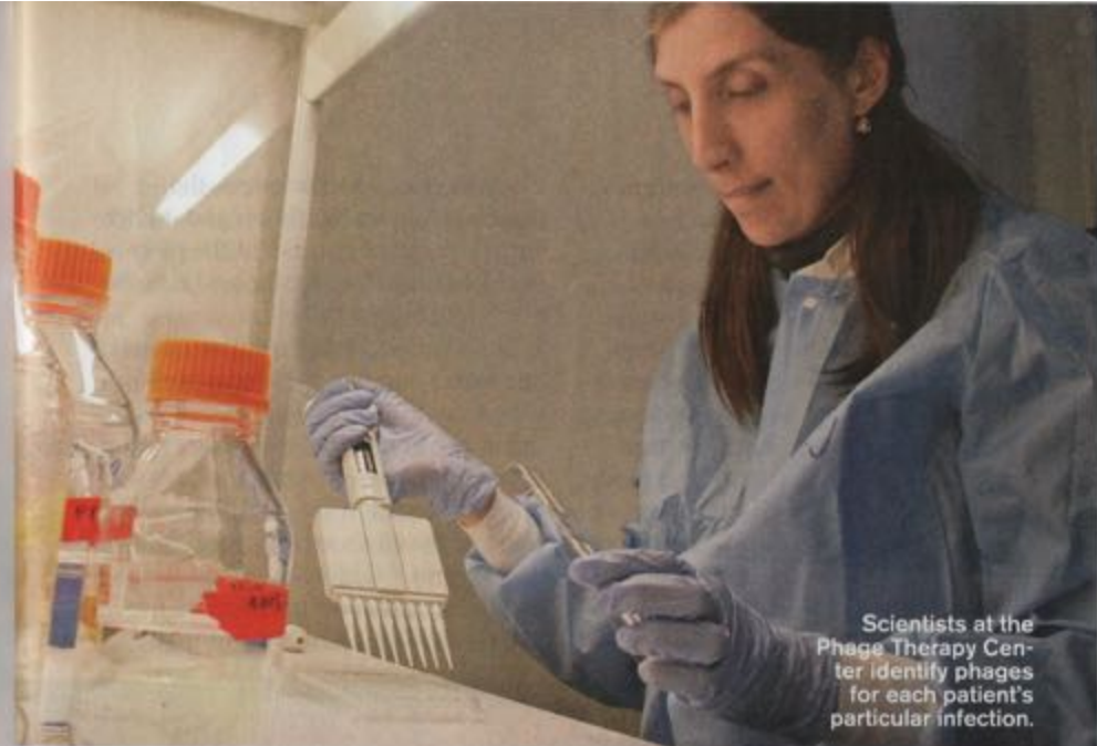
Scientists at the Phage Therapy Center identify phages for each patient’s particular infection.